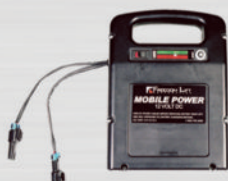
Mobile Power Pack