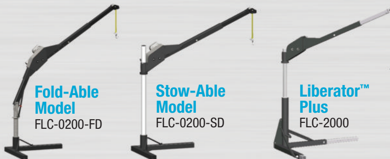
Fold-Able Model FLC-0200-FD