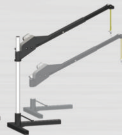
Stow-Able Model Showing Stowaway Feature FLC-0200-SD