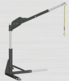
Liberator Plus Showing Stowaway Feature FLC-2000