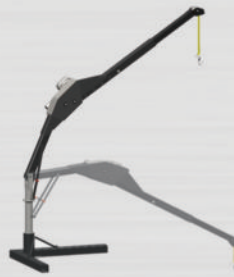
Fold-Able Model Showing Foldaway Feature FLC-0200-FD