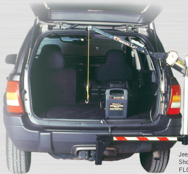
Jeep Grand Cherokee Shown with FLC-0200-BSR3